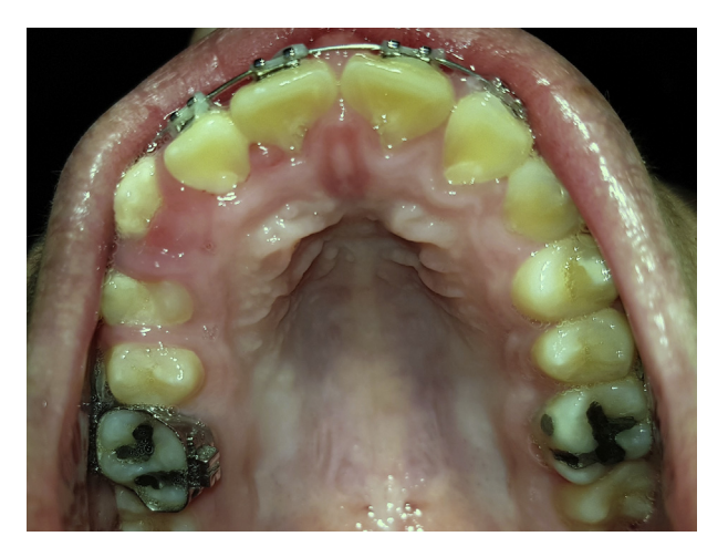
Fig. 6-3 months after treatment. No signs of recurrence were still evidenced.

remains unclear, therefore novel studies are needed to stablish more evidence on this aetiological association.