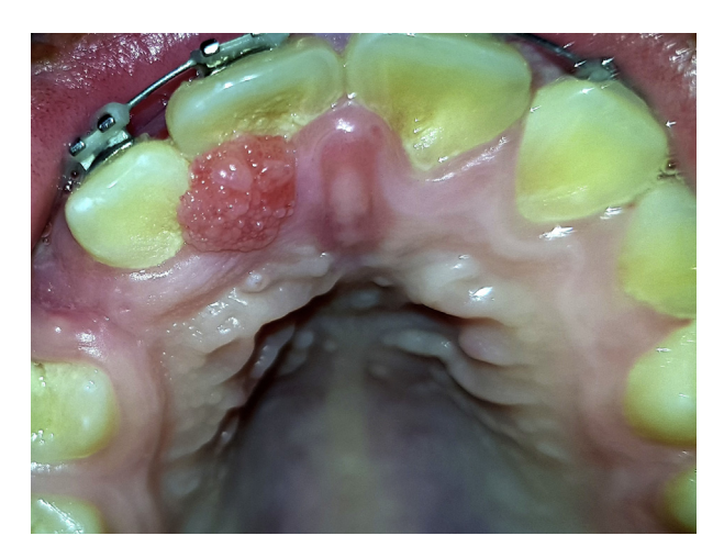
Fig. 4-9-months after local removal of the lesion, the recurrence was detected. The clinical aspect of the lesion was like the first presentation of the condition but this time only the palatine gingiva was involved.

Different authors have previously described successful application of TA in cases of warts, HPV-associated cervical lesions [13] or Focal Epithelial Hyperplasia (FEH) [14]. All these lesions are associated to HPV infection. Our case showed a marked improvement of lesions of LJSGH once there were treated with TA, suggesting that the response of the tissue to the drug could be associate with some viral origin. This relationship was previously reported by Chang who described a micropapillary architecture of LJSGH suggesting an association with HPV [2]. However, Argyris et al., reported the overexpression of p16 as a phenomenon caused by the intense inflammatory infiltration of the tissues rather than a HPV-mediated process as supported by the failure of find HPV-DNA in the majority of cases. The viral origin of LJSGH