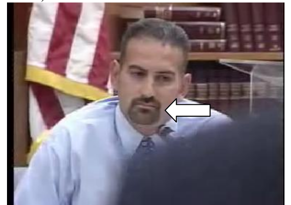
"Sh- ↑ Four feet maybe ..."

Photogram 2: Head movement to the right (first stroke)