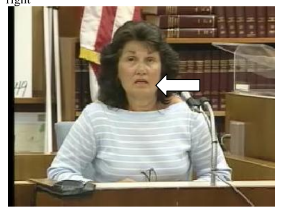
Photogram 9: Slight head movement towards the right