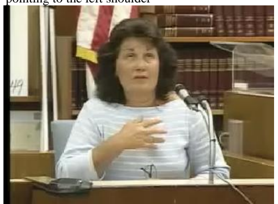
"they kin' 'f- if I \ remember right"

The gesture with the hand in which the speaker appears to be "sweeping the air" constitutes an abstract deictic (Haviland, 2000 in Montes Miró, 2003) because it represents visually the meaning of the referent of "back" in the phrase "the back of the motor home". Regarding the head shake, it starts before the verbalization of "they kin' 'f- if I ↑ remember right", it is produced simultaneously with the utterance and it finishes after the utterance has been delivered. This feature of gestures was observed early on by Kendon (1980), who explains that "[g]esticulations typically begin before the verbal articulation of ideas, which suggests that the formulation of ideas, in a form of action which is iconic or analogic to those ideas, is as fundamental a process as the formulation of ideas in verbal form" (1980: 209). The stroke of the head gesture is realized approximately before uttering "remember".