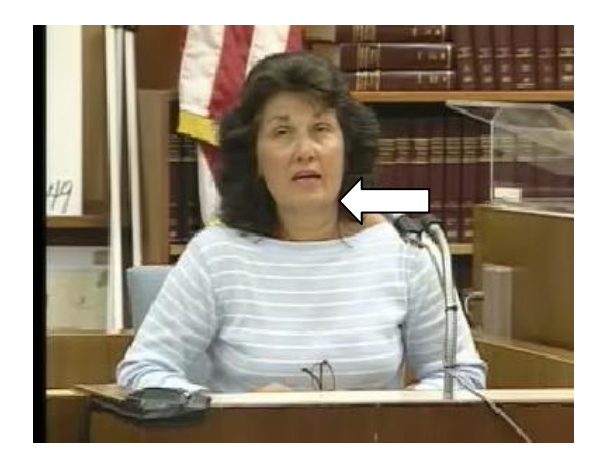
Photogram 5: Slight head movement to the right