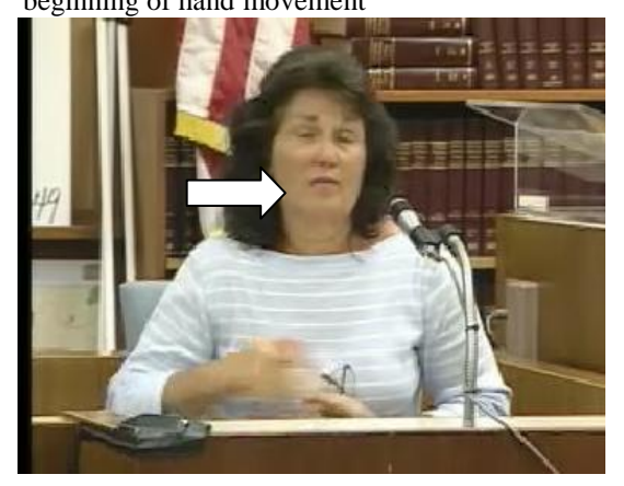
Photogram 6: Head movement to the left and beginning of hand movement