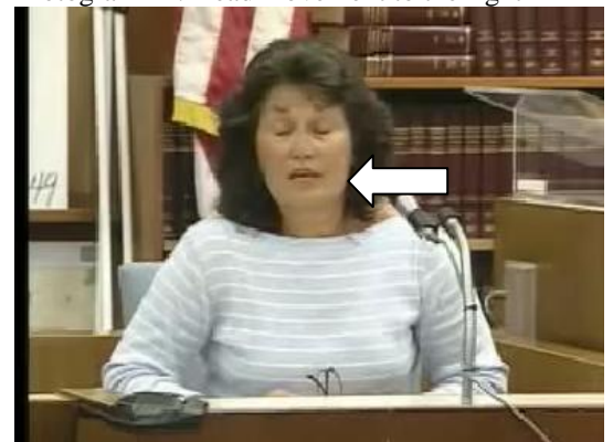
Photogram 12: Head movement to the left

Photogram 11: Head movement to the right