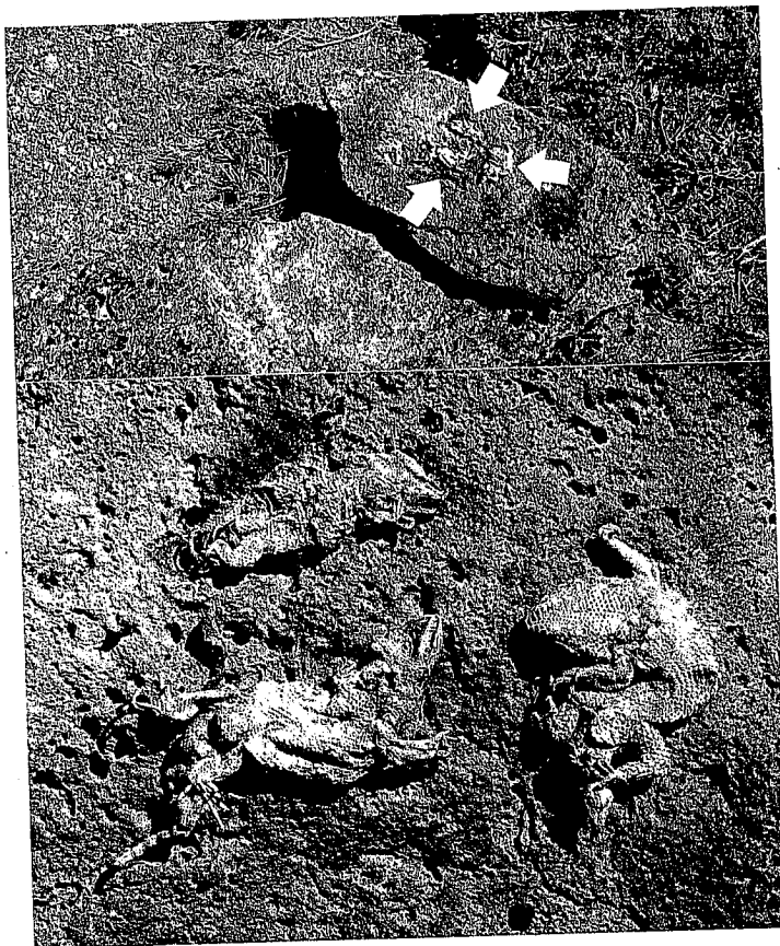
Fig. 1. Upper: general view of the site where the three lizards were found dead in the rock. Below: Detail of the three carcasses.